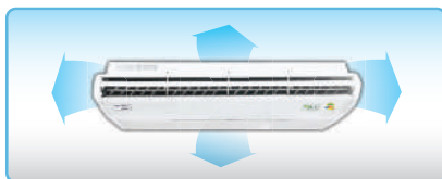
4 Directional auto-swing air louver