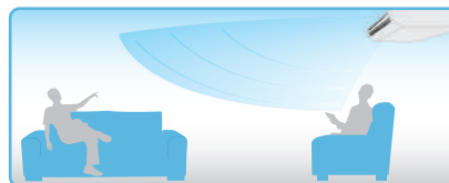
Deliver cool air in wide area including area below the unit